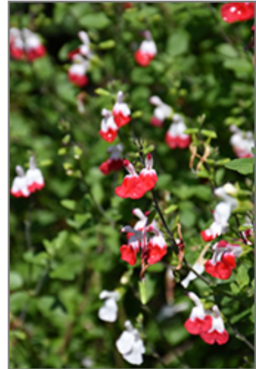
Hot Lips Sage flowers

Hot Lips Sage is a fine choice for the garden, but it is also a good selection for planting in outdoor pots and containers. With its upright habit of growth, it is best suited for use as a 'thriller' in the 'spiller-thriller-filler' container combination; plant it near the center of the pot, surrounded by smaller plants and those that spill over the edges. It is even sizeable enough that it can be grown alone in a suitable container. Note that when growing plants in outdoor containers and baskets, they may require more frequent waterings than they would in the yard or garden.