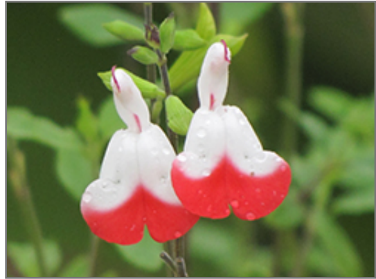
Hot Lips Sage flowers

This is a relatively low maintenance plant, and should only be pruned after flowering to avoid removing any of the current season's flowers. It is a good choice for attracting bees, butterflies and hummingbirds to your yard, but is not particularly attractive to deer who tend to leave it alone in favor of tastier treats. It has no significant negative characteristics.