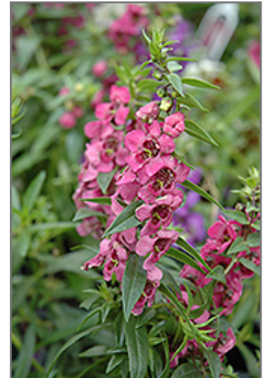
Pink Angelonia flowers