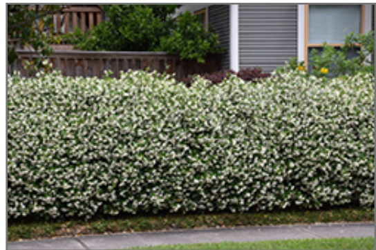
Confederate Star-Jasmine in bloom