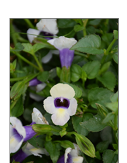
Catalina Grape-O-Licious Torenia flowers