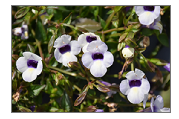
Catalina Grape-O-Licious Torenia flowers

1232 Canal Street New Smyrna Beach, FL 32168 Phone: 386-428-7298 Website: www.lindleysgardencenter.com