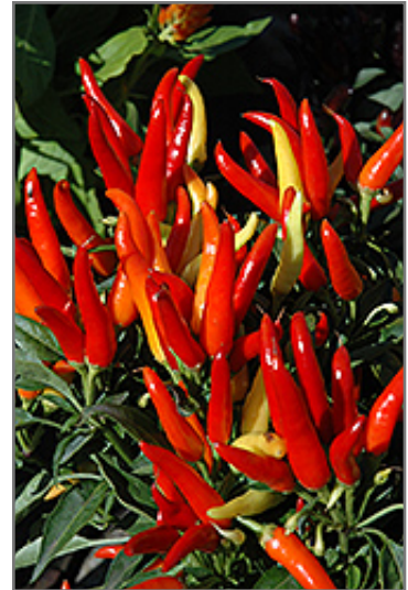
Chilly Chili Ornamental Pepper fruit

Chilly Chili Ornamental Pepper is an herbaceous annual with an upright spreading habit of growth. Its medium texture blends into the garden, but can always be balanced by a couple of finer or coarser plants for an effective composition.