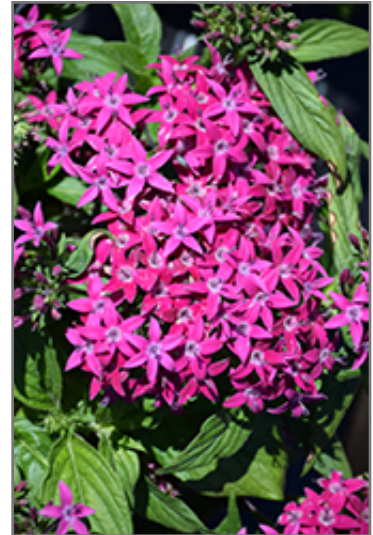
Graffiti Violet Pentas flowers