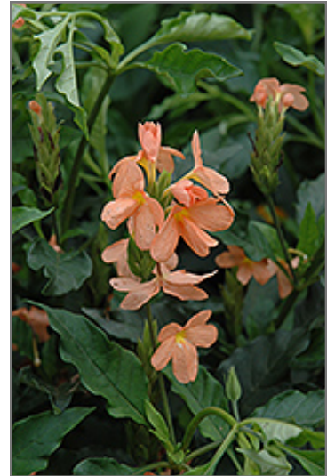
Crossandra flowers

Crossandra is a fine choice for the garden, but it is also a good selection for planting in outdoor pots and containers. It can be used either as 'filler' or as a 'thriller' in the 'spiller-thriller-filler' container combination, depending on the height and form of the other plants used in the container planting. Note that when growing plants in outdoor containers and baskets, they may require more frequent waterings than they would in the yard or garden.