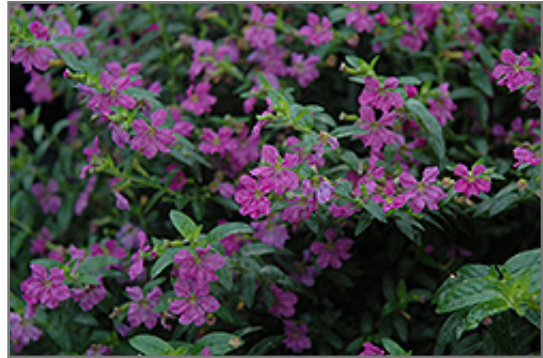
Allyson Mexican Heather flowers