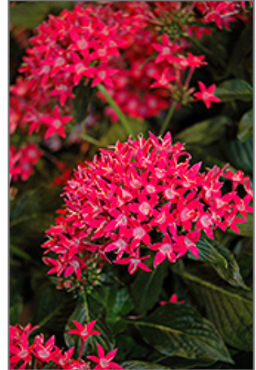
Starcluster Rose Pentas flowers