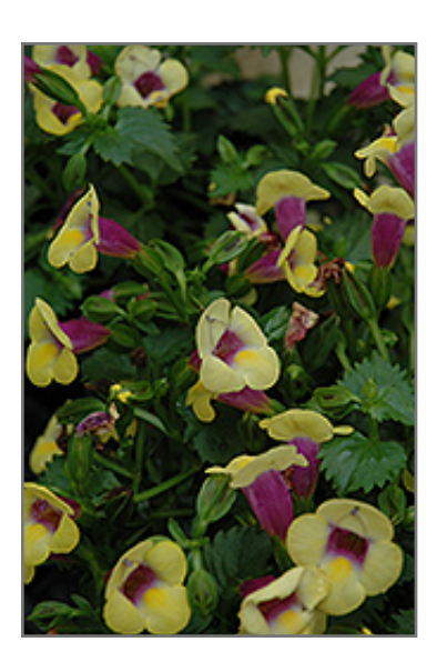
Yellow Moon Torenia flowers

Yellow Moon Torenia is an herbaceous annual with a trailing habit of growth, eventually spilling over the edges of hanging baskets and containers. Its relatively fine texture sets it apart from other garden plants with less refined foliage.