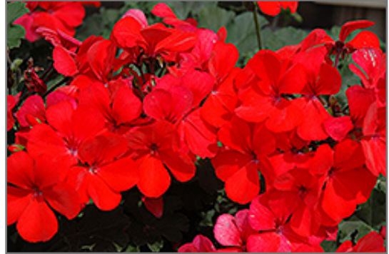
Caliente Orange Geranium flowers

Caliente Orange Geranium features bold balls of lightly-scented orange flowers at the ends of the stems from late spring to early fall. The flowers are excellent for cutting. Its tomentose round palmate leaves remain green in color with prominent brown stripes throughout the year.