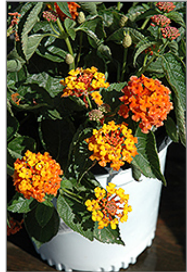
Bandito Orange Sunrise Lantana flowers

Bandito Orange Sunrise Lantana will grow to be about 14 inches tall at maturity, with a spread of 14 inches. When grown in masses or used as a bedding plant, individual plants should be spaced approximately 12 inches apart. It has a low canopy. It grows at a fast rate, and under ideal conditions can be expected to live for approximately 20 years.