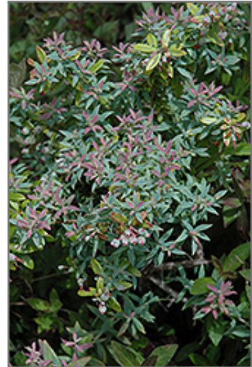
Rosa's Blush Blueberry fruit

Rosa's Blush Blueberry features dainty clusters of shell pink bell-shaped flowers hanging below the branches in early spring. It has red-variegated bluish-green foliage which emerges rose in spring. The glossy oval leaves turn an outstanding plum purple in the fall, which persists throughout the winter. It features an abundance of magnificent blue berries in late spring.