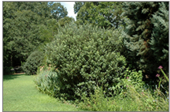
Pineapple Guava