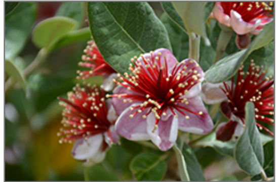
Pineapple Guava flowers

Pineapple Guava is a multi-stemmed evergreen shrub with an upright spreading habit of growth. Its average texture blends into the landscape, but can be balanced by one or two finer or coarser trees or shrubs for an effective composition.