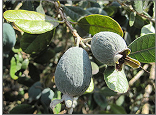
Pineapple Guava fruit

Pineapple Guava makes a fine choice for the outdoor landscape, but it is also well-suited for use in outdoor pots and containers. Its large size and upright habit of growth lend it for use as a solitary accent, or in a composition surrounded by smaller plants around the base and those that spill over the edges. It is even sizeable enough that it can be grown alone in a suitable container. Note that when grown in a container, it may not perform exactly as indicated on the tag - this is to be expected. Also note that when growing plants in outdoor containers and baskets, they may require more frequent waterings than they would in the yard or garden.