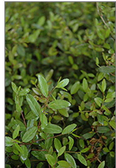
Schilling's Dwarf Yaupon Holly foliage