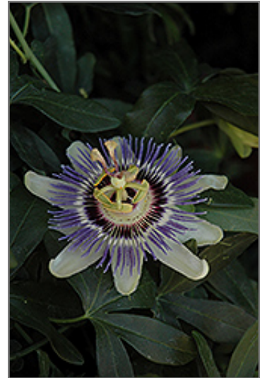
Incense Passion Flower flowers

Incense Passion Flower will grow to be about 15 feet tall at maturity, with a spread of 30 inches. As a climbing vine, it tends to be leggy near the base and should be underplanted with low-growing facer plants. It should be planted near a fence, trellis or other landscape structure where it can be trained to grow upwards on it, or allowed to trail off a retaining wall or slope. It grows at a fast rate, and under ideal conditions can be expected to live for approximately 10 years.