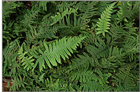
E. T. Fern foliage

Other Names: Frog Foot Fern, Grub Fern, Crisatum Fern