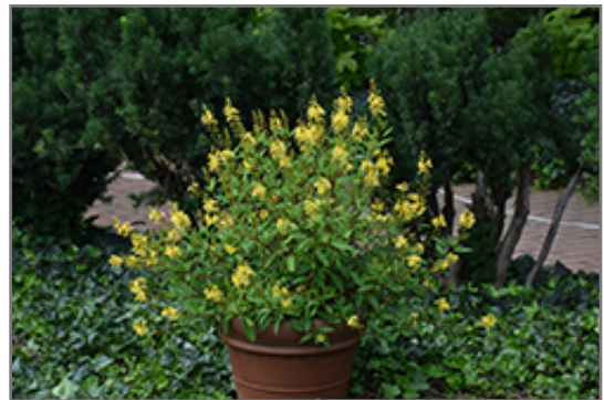
Thryallis in bloom