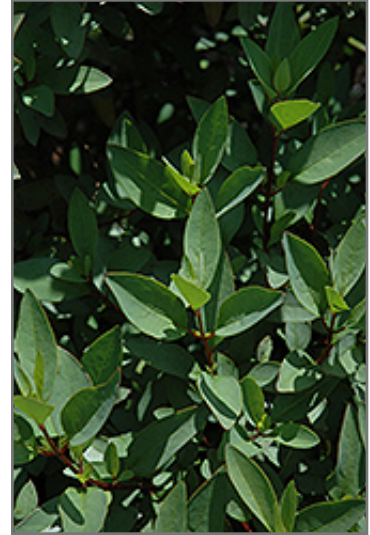
Thryallis foliage

This shrub does best in full sun to partial shade. It is very adaptable to both dry and moist growing conditions, but will not tolerate any standing water. It may require supplemental watering during periods of drought or extended heat. It is not particular as to soil pH, but grows best in sandy soils. It is somewhat tolerant of urban pollution. Consider applying a thick mulch around the root zone in winter to protect it in exposed locations or colder microclimates. This species is not originally from North America.