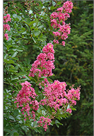
Hopi Crapemyrtle flowers