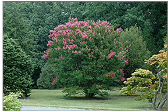
Hopi Crapemyrtle in bloom