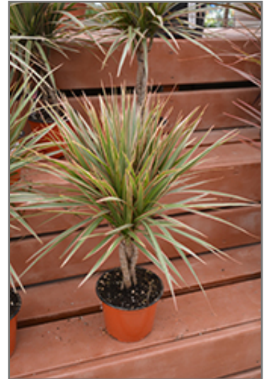
Colorama Dracaena in full

When grown indoors, Colorama Dracaena can be expected to grow to be about 3 feet tall at maturity, with a spread of 24 inches. It grows at a medium rate, and under ideal conditions can be expected to live for approximately 10 years. This houseplant performs well in both bright or indirect sunlight and strong artificial light, and can therefore be situated in almost any well-lit room or location. It does best in average to evenly moist soil, but will not tolerate standing water. The surface of the soil shouldn't be allowed to dry out completely, and so you should expect to water this plant once and possibly even twice each week. Be aware that your particular watering schedule may vary depending on its location in the room, the pot size, plant size and other conditions; if in doubt, ask one of our experts in the store for advice. It is not particular as to soil type or pH; an average potting soil should work just fine.