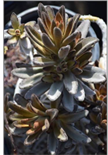
Velvet Leaf Kalanchoe

This is an herbaceous evergreen houseplant with a mounded form. This plant may benefit from an occasional pruning to look its best.