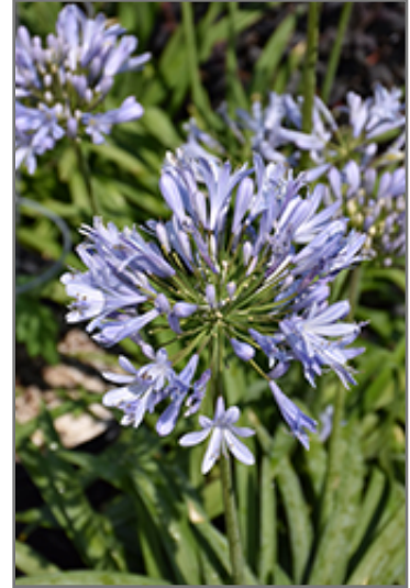
Barley Blue Agapanthus flowers

This compact variety produces a dense mound of luxurious narrow green foliage; clusters of pale blue flowers appear early and profusely; a re-blooming accent plant for the garden or massed along borders; foliage is evergreen