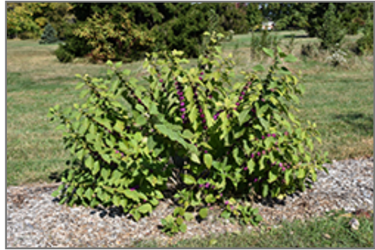
American Beautyberry fruit

Beautyberry is a quintessential Florida Native shrub that brings beauty and function: flowers are pollinator magnet, the berries (edible, if not delectable) are attractive to birds and ripen into the most striking amethyst color, sure to brighten up any corner of the garden. The leaves have insect repelling properties when rubbed onto skin. Beautyberry can be pruned back and bears most profusely on new growth.