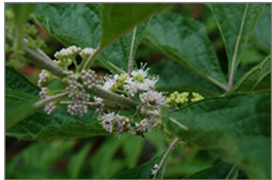
American Beautyberry flowers