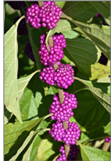
American Beautyberry fruit

American Beautyberry is recommended for the following landscape applications;