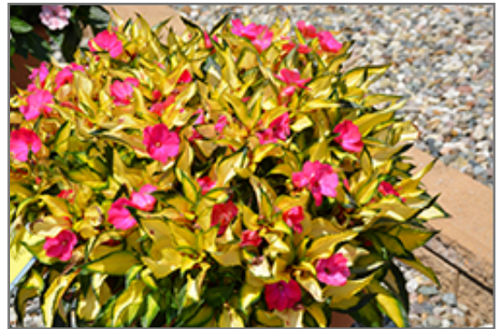
SunPatiens Compact Tropical Rose New Guinea Impatiens in bloom