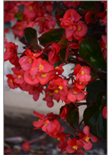
Megawatt Red Bronze Leaf Begonia flowers

Megawatt Red Bronze Leaf Begonia is an herbaceous evergreen perennial with an upright spreading habit of growth. Its medium texture blends into the garden, but can always be balanced by a couple of finer or coarser plants for an effective composition.