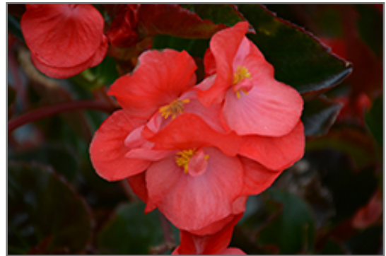
Megawatt Red Bronze Leaf Begonia flowers