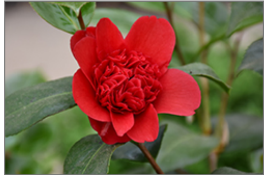
Professor Sargent Camellia flowers

Professor Sargent Camellia will grow to be about 8 feet tall at maturity, with a spread of 8 feet. It has a low canopy with a typical clearance of 1 foot from the ground, and is suitable for planting under power lines. It grows at a medium rate, and under ideal conditions can be expected to live for 40 years or more.