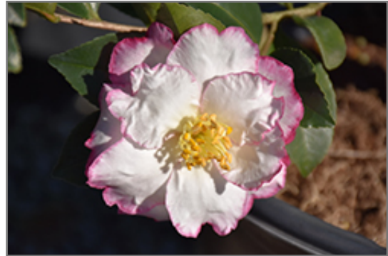
Leslie Ann Camellia flowers

Leslie Ann Camellia will grow to be about 10 feet tall at maturity, with a spread of 10 feet. It has a low canopy with a typical clearance of 1 foot from the ground, and is suitable for planting under power lines. It grows at a medium rate, and under ideal conditions can be expected to live for 40 years or more.