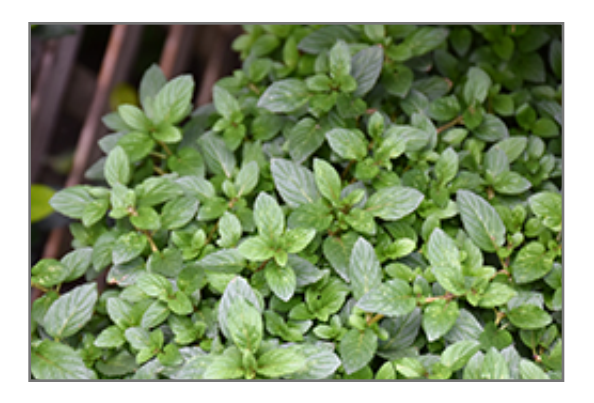
Peppermint foliage

Peppermint features bold spikes of lavender flowers with pink overtones rising above the foliage in mid summer. Its attractive fragrant pointy leaves remain green in color throughout the season.