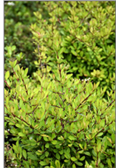
Dwarf Walter's Viburnum foliage