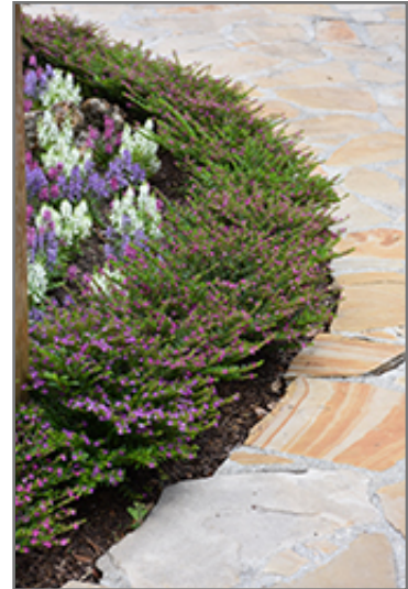
FloriGlory Diana Mexican Heather flowers

FloriGlory Diana Mexican Heather is recommended for the following landscape applications;