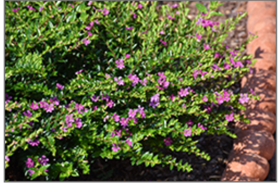
FloriGlory Diana Mexican Heather flowers

FloriGlory Diana Mexican Heather will grow to be about 14 inches tall at maturity, with a spread of 24 inches. When grown in masses or used as a bedding plant, individual plants should be spaced approximately 18 inches apart. It tends to fill out right to the ground and therefore doesn't necessarily require facer plants in front. It grows at a fast rate, and under ideal conditions can be expected to live for approximately 10 years.