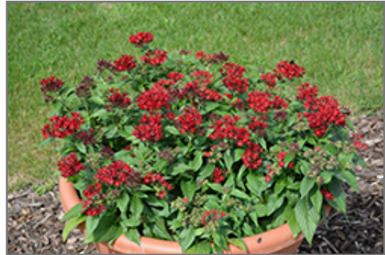
Lucky Star Dark Red Pentas in bloom

Lucky Star Dark Red Pentas will grow to be about 12 inches tall at maturity, with a spread of 14 inches. When grown in masses or used as a bedding plant, individual plants should be spaced approximately 10 inches apart. Its foliage tends to remain dense right to the ground, not requiring facer plants in front. This fast-growing annual will normally live for one full growing season, needing replacement the following year.