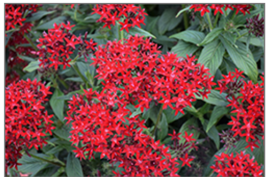
Lucky Star Dark Red Pentas flowers