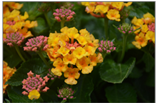
Bandana Orange Lantana flowers