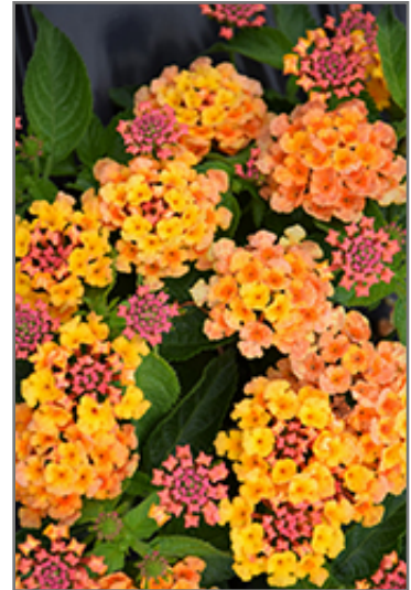
Bandana Orange Lantana flowers

This is a relatively low maintenance shrub, and should not require much pruning, except when necessary, such as to remove dieback. It is a good choice for attracting butterflies and hummingbirds to your yard, but is not particularly attractive to deer who tend to leave it alone in favor of tastier treats. It has no significant negative characteristics.