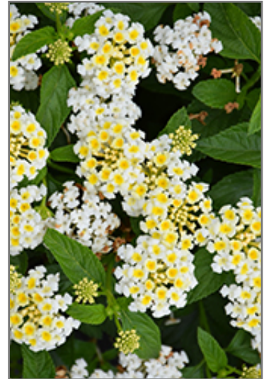
Bandana White Lantana flowers

Bandana White Lantana is recommended for the following landscape applications;