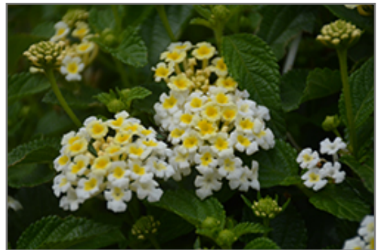
Bandana White Lantana flowers