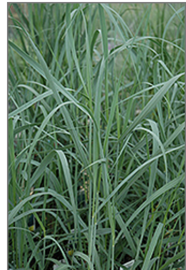
Heavy Metal Blue Switch Grass foliage