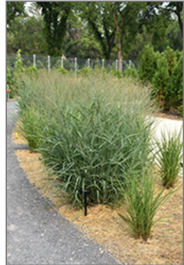
Heavy Metal Blue Switch Grass

Heavy Metal Blue Switch Grass will grow to be about 4 feet tall at maturity, with a spread of 3 feet. It tends to be leggy, with a typical clearance of 1 foot from the ground, and should be underplanted with lower-growing perennials. It grows at a medium rate, and under ideal conditions can be expected to live for approximately 15 years. As an herbaceous perennial, this plant will usually die back to the crown each winter, and will regrow from the base each spring. Be careful not to disturb the crown in late winter when it may not be readily seen!