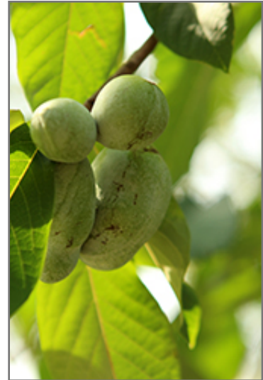
Pawpaw fruit

* This is a 'special order' plant - contact store for details