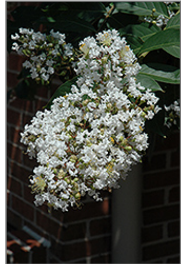
Natchez Crapemyrtle flowers

Natchez Crapemyrtle is recommended for the following landscape applications;