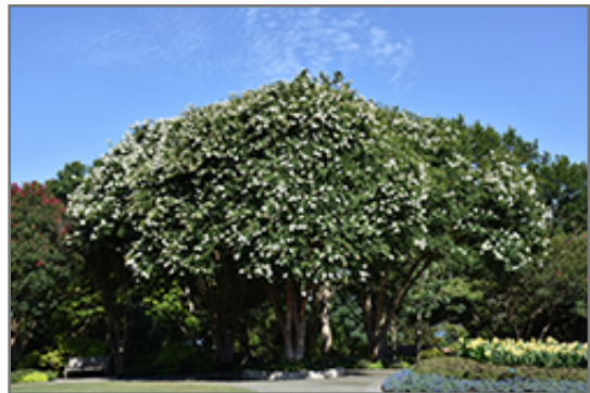
Natchez Crapemyrtle in bloom