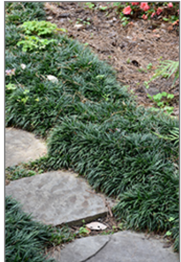
Dwarf Mondo Grass