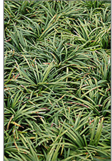
Dwarf Mondo Grass foliage