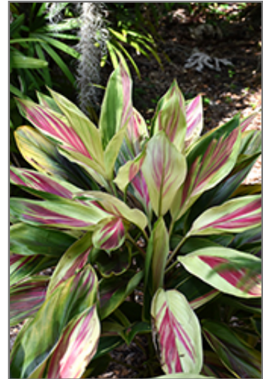
Exotica Hawaiian Ti Plant

Exotica Hawaiian Ti Plant will grow to be about 5 feet tall at maturity, with a spread of 3 feet. It has a low canopy with a typical clearance of 1 foot from the ground, and is suitable for planting under power lines. It grows at a medium rate, and under ideal conditions can be expected to live for approximately 10 years.