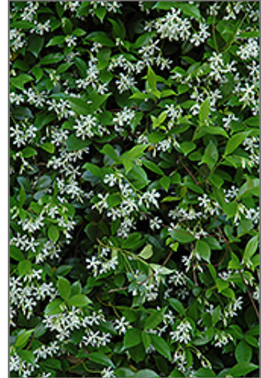
Confederate Star-Jasmine flowers