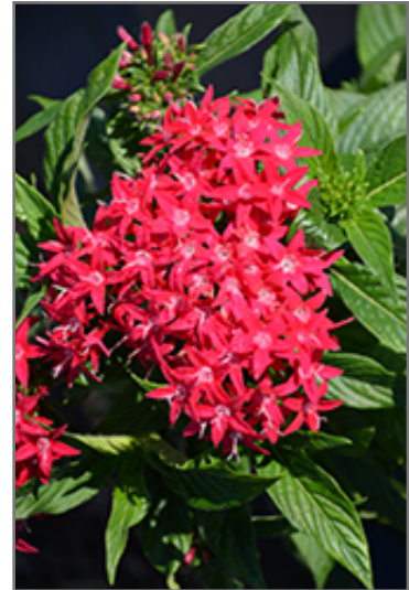
Graffiti Lipstick Pentas flowers

Graffiti Lipstick Pentas is recommended for the following landscape applications;