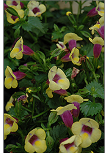
Yellow Moon Torenia flowers

Yellow Moon Torenia is recommended for the following landscape applications;