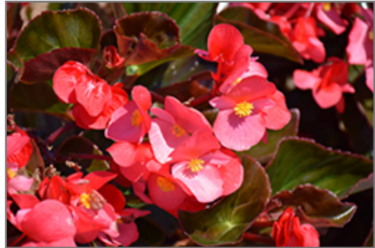
Whopper Rose Bronze Leaf Begonia flowers

Whopper Rose Bronze Leaf Begonia is recommended for the following landscape applications;