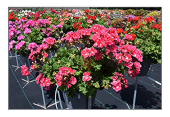
Fantasia Strawberry Sizzle Geranium in bloom

1232 Canal Street New Smyrna Beach, FL 32168 Phone: 386-428-7298 Website: www.lindleysgardencenter.com