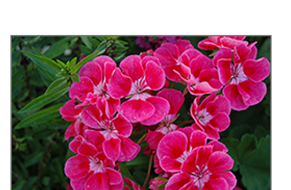
Fantasia Strawberry Sizzle Geranium flowers