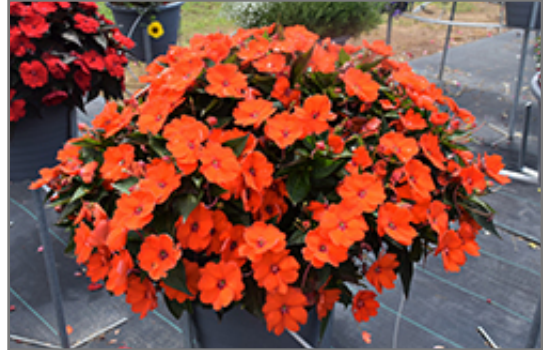
SunPatiens Compact Electric Orange New Guinea Impatiens in bloom

SunPatiens Compact Electric Orange New Guinea Impatiens is a fine choice for the garden, but it is also a good selection for planting in outdoor containers and hanging baskets. It can be used either as 'filler' or as a 'thriller' in the 'spiller-thriller-filler' container combination, depending on the height and form of the other plants used in the container planting. It is even sizeable enough that it can be grown alone in a suitable container. Note that when growing plants in outdoor containers and baskets, they may require more frequent waterings than they would in the yard or garden.