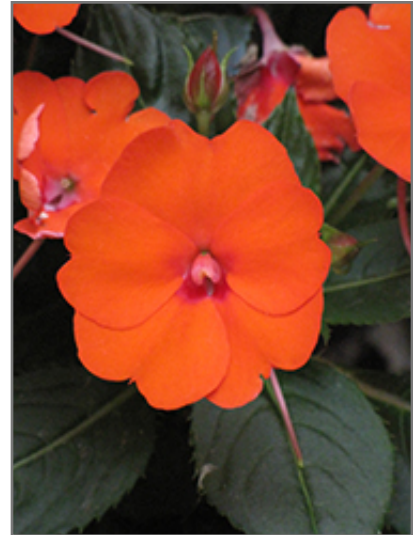
SunPatiens Compact Electric Orange New Guinea Impatiens flowers

This plant will require occasional maintenance and upkeep, and should not require much pruning, except when necessary, such as to remove dieback. It is a good choice for attracting bees and butterflies to your yard. It has no significant negative characteristics.