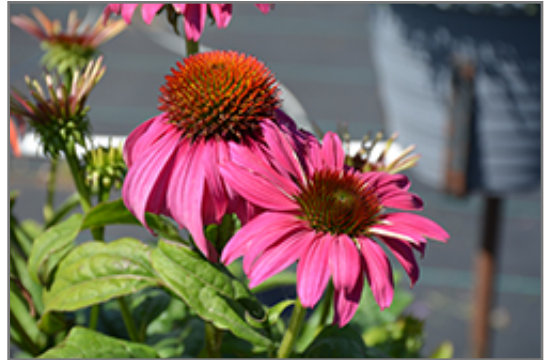
Cheyenne Spirit Coneflower flowers

Cheyenne Spirit Coneflower will grow to be about 16 inches tall at maturity extending to 24 inches tall with the flowers, with a spread of 18 inches. Its foliage tends to remain dense right to the ground, not requiring facer plants in front. It grows at a medium rate, and under ideal conditions can be expected to live for approximately 10 years. As an herbaceous perennial, this plant will usually die back to the crown each winter, and will regrow from the base each spring. Be careful not to disturb the crown in late winter when it may not be readily seen!