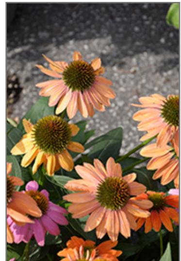
Cheyenne Spirit Coneflower flowers