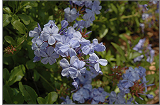
Cape Plumbago flowers

Cape Plumbago is recommended for the following landscape applications;