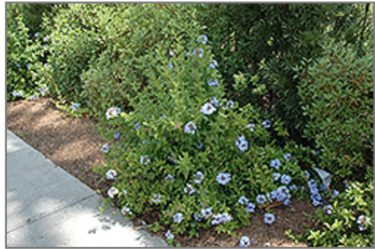
Cape Plumbago in bloom