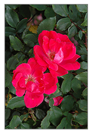
Red Knock Out Rose flowers