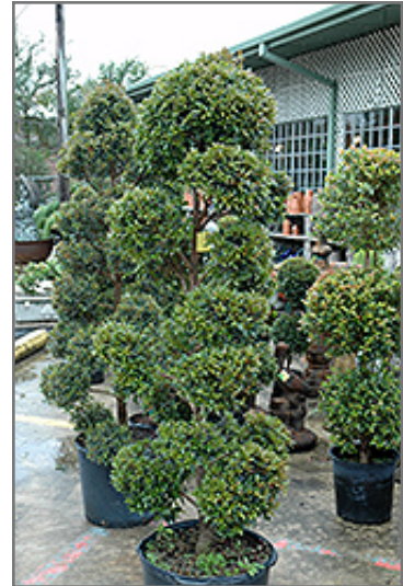
Brush Cherry