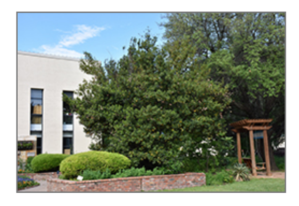
Bay Laurel

Bay Laurel is recommended for the following landscape applications;