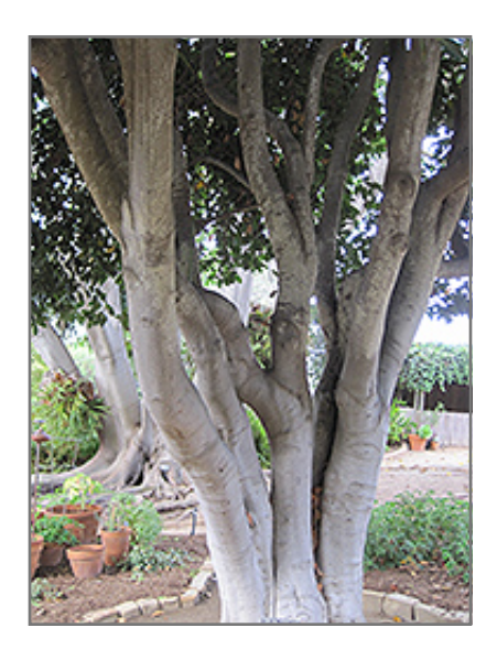
Bay Laurel bark

This tree does best in full sun to partial shade. It does best in average to evenly moist conditions, but will not tolerate standing water. It may require supplemental watering during periods of drought or extended heat. It is not particular as to soil type or pH. It is somewhat tolerant of urban pollution. This species is not originally from North America. It can be propagated by cuttings.