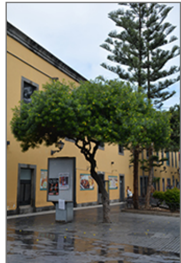
Yellow Oleander in bloom