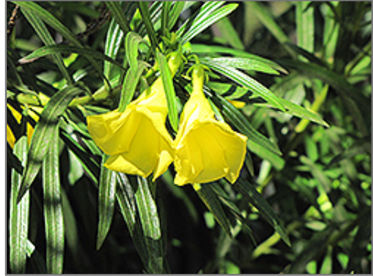
Yellow Oleander flowers